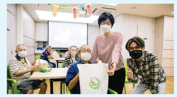
Visit to PCF Sparkle Care Centre