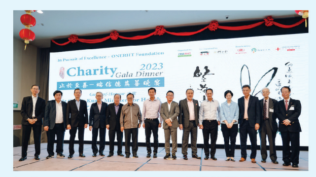
In Pursuit Of Excellence – ONERHT Foundation Charity Art Exhibition And Gala Dinner